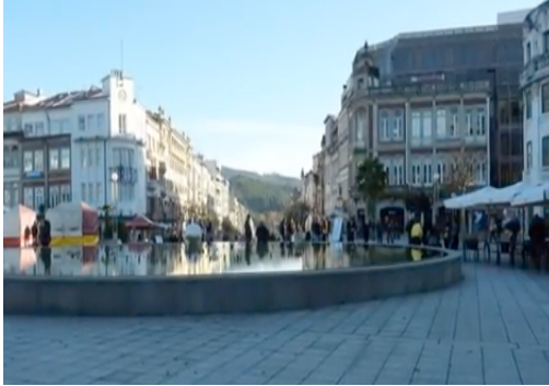
Barcelos is a Portuguese city that belongs to the Braga district.